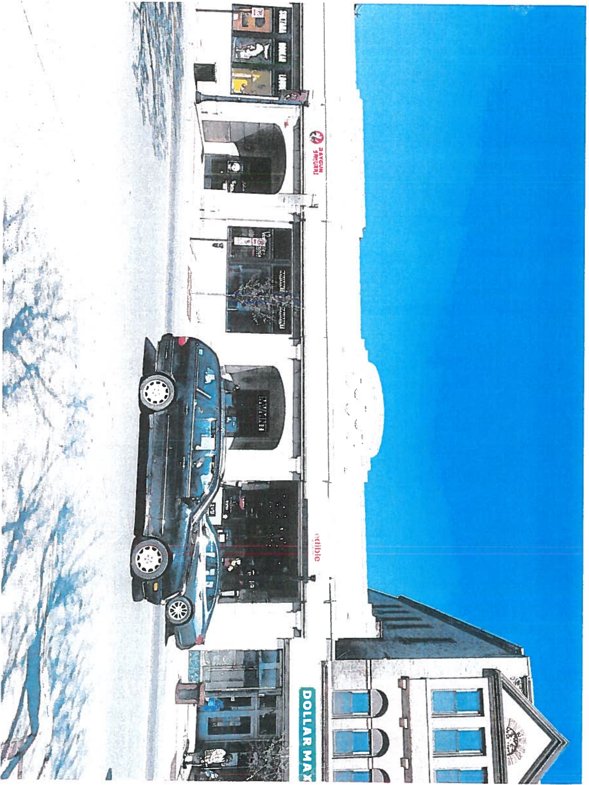
Existing Storefront (MVMNT) with Neighboring Storefronts